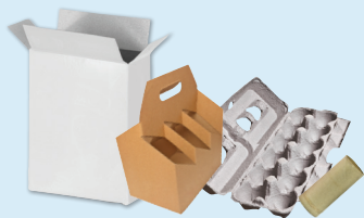
Boxboard (Dry-food boxes, egg cartons, & rolls)