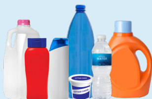
Plastic Bottles, Jugs, Tubs, & Lids (Empty kitchen, laundry, & bath containers)