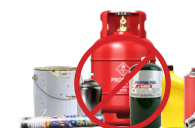
HAZARDOUS MATERIALS OR EXPLOSIVES