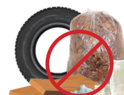
WOOD, WASTE, OR TIRES